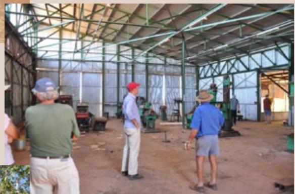
Allied Works Building Elliott