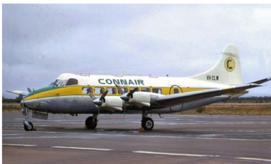
VH-CLW Heron Aircraft