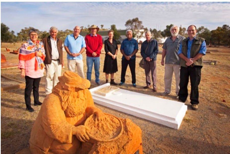
Council Members 2014/15