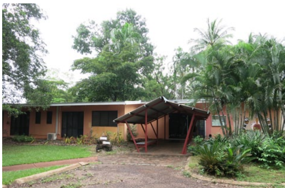
Old Batchelor Hospital