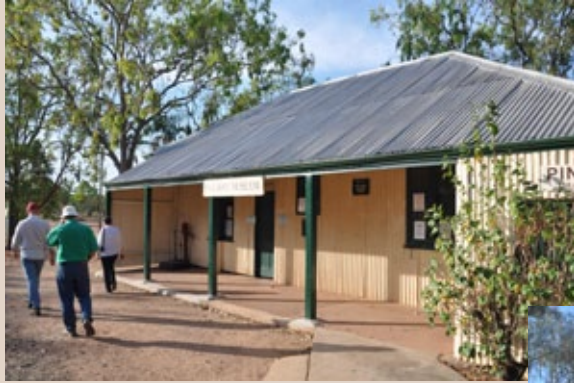
Pine Creek Railway Museum