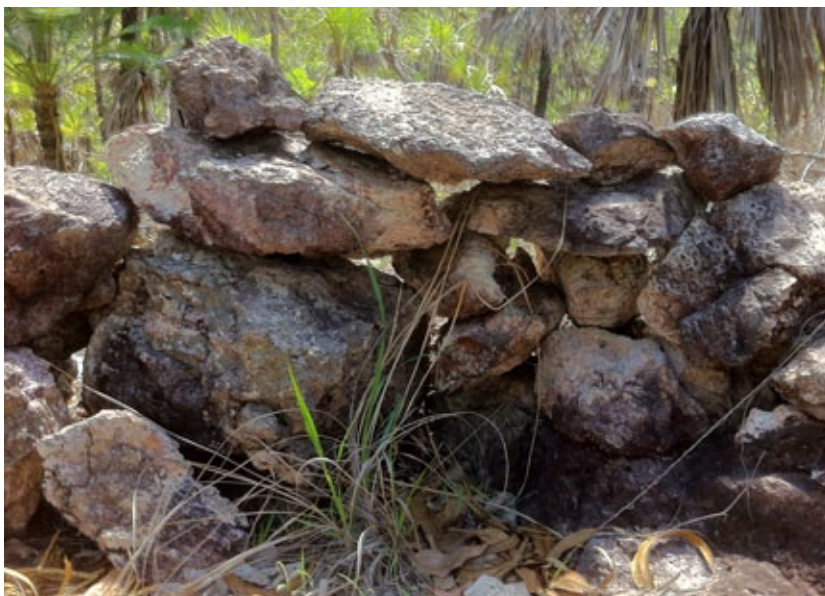
WWII Defence Position, Zuccoli