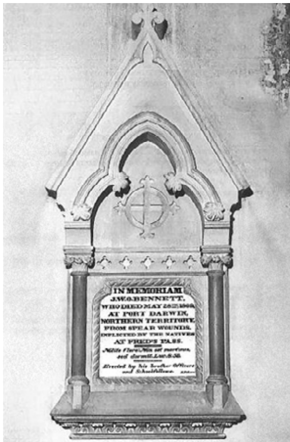
John William Ogilvie Bennett Memorial

Under the transitional provisions of the new Heritage Act , all places and objects declared under the old Act have the same status under the new Act . A complete list of all declared places and objects as at 30 June 2015 is provided at Appendix One.