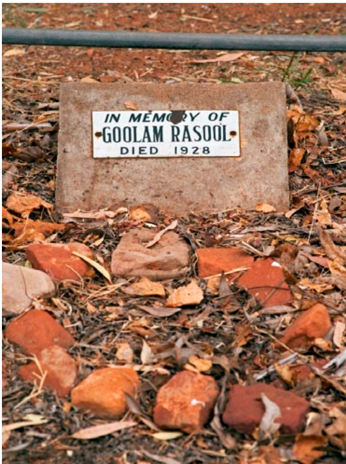
Goolam Rasool Nazar's grave, Alice Springs