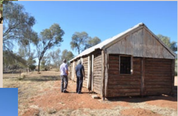
Mt Riddock at Gemtree